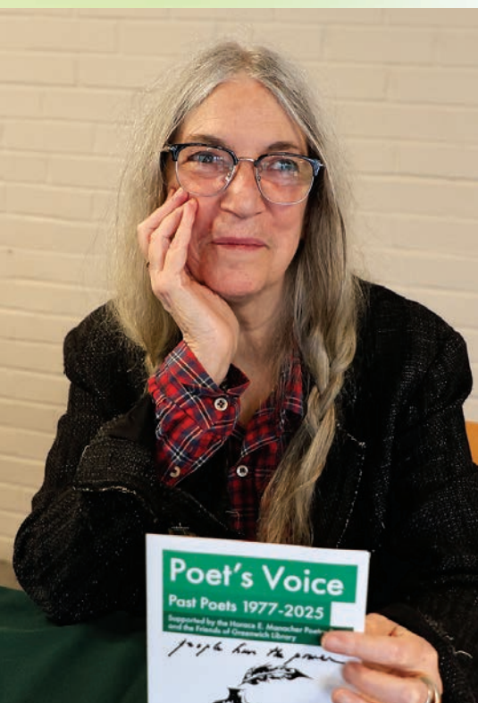
Musician, poet, and cultural icon Patti Smith performed for Poetry Month.

VOLUNTEERING to support programs and services for patrons throughout the Library buildings. The Friends of Greenwich Library support performing arts for children and adults, a fifty-year-long Oral History project, continued education for staff, and so much more.