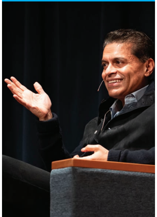
Fareed Zakaria in the Berkley Theater.