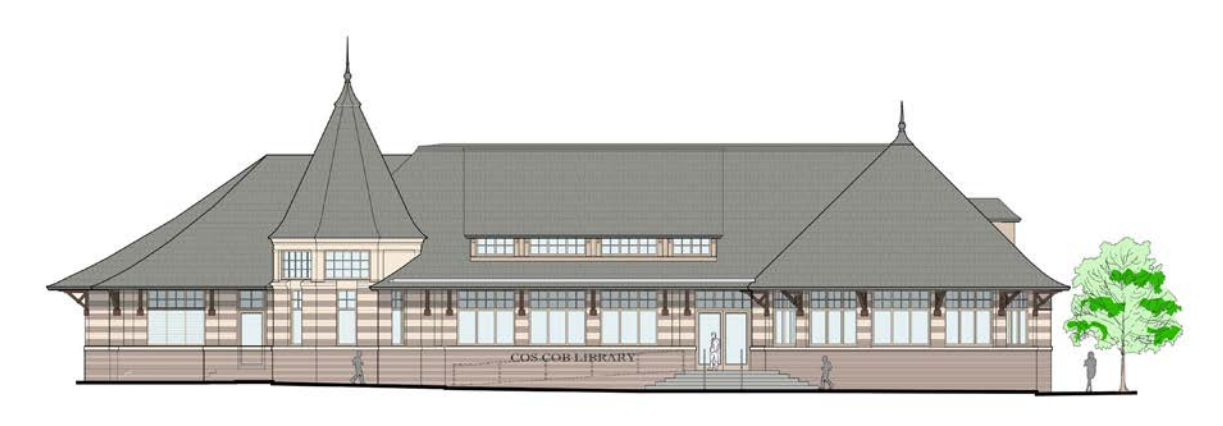
SOUTH ELEVATION- PROPOSED