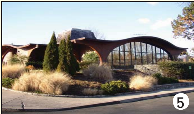
Fifth site, 1974: 21 Mead Avenue, Byram Shubert Library.