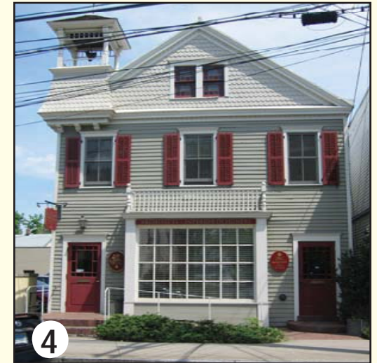
Fourth site, 1954: Old Fire Station at 245 Mill Street, now Jones, Footer, Margeotes, an architectural firm.