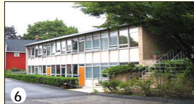
Sixth site, 2006: 286 Delavan Avenue, St. Paul Lutheran Church, temporary site while library was being renovated.