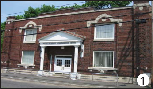
First site, 1931: 289 Delavan Avenue, "New Lebanon Library," second floor of Cygnet Athletic Club, now Byram Archibald Neighborhood Center.