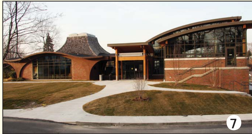
Seventh site, 2009: 21 Mead Avenue, the new Byram Shubert Library.