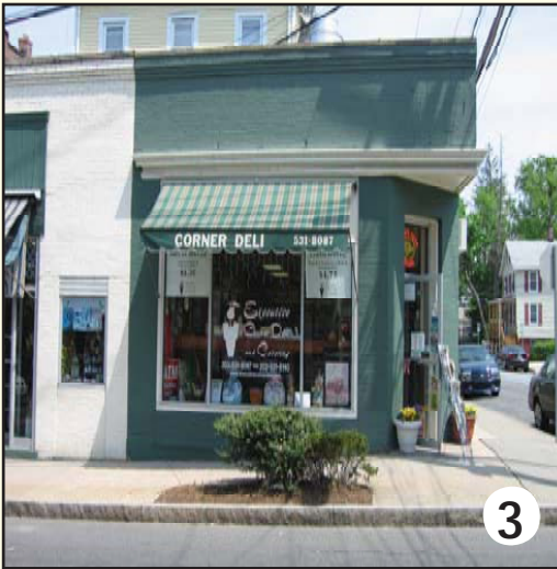
Third site, 1952: 229 Mill Street, a small storefront, now Executive Corner Deli and Catering.